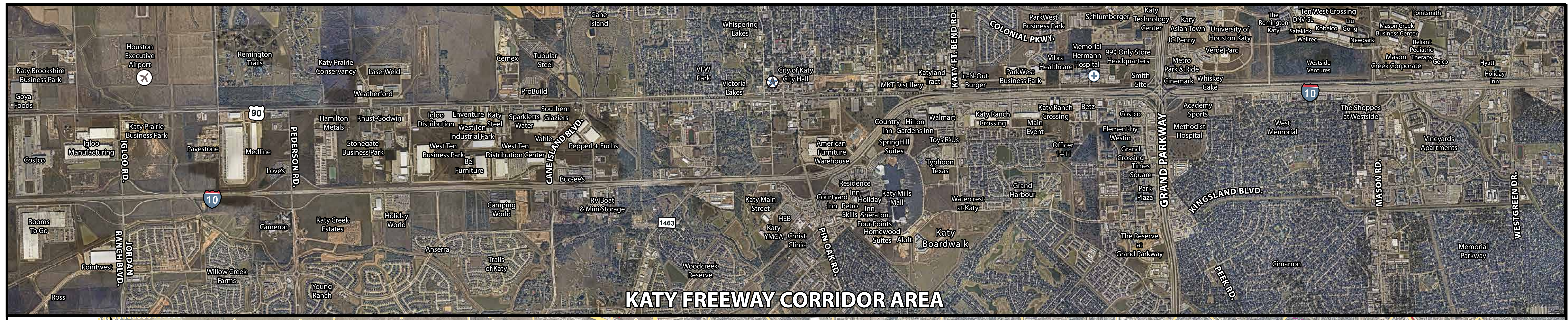
KATY FREEWAY CORRIDOR AREA